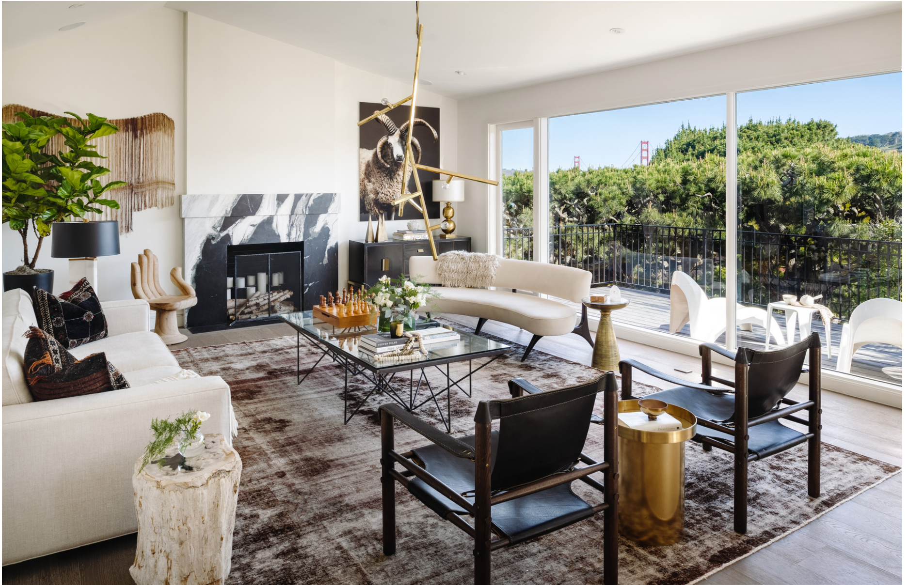
Sea Cliff 20 25th Avenue